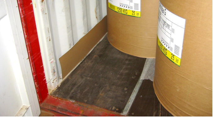
Uneven walls and floors in containers and trains may cause transport damage to the loaded goods. This can be avoided by using Flatboards as side and floor protection.

Eltete TPM Ltd (Transport Packaging Materials) is a global carton board converter and an ISOcertified supplier of 100% recyclable transport packaging materials. With our own engineering division we are able to react quickly to customer demands.